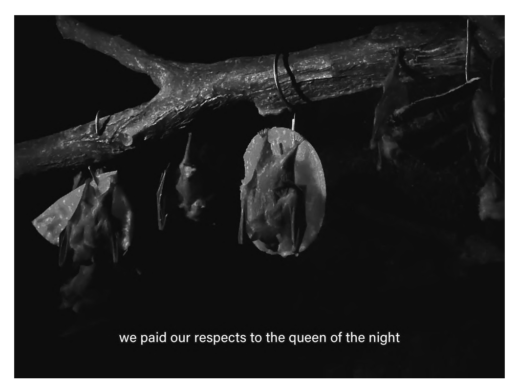
Kindred, 2021, still from the video, 1920x1080, 25p. color, stereo 7'38"